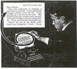
April 25, on the train. Dear Harry: The man behind the man behind the gun—the man who hazard their lives in order to get the "News"—and who, when they get that news—forward it with all possible haste to the public, use Corona Folding Typewriters. John Reed, Mexican War Correspondent of the Metropolitan Magazine, is pictured above. We also reproduce excerpt from a letter he wrote his Managing Editor just after he had first used a— CORONA Folding Typewriter