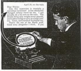
The War News You Read is First Written on Corona Typewriters The men behind the men behind the guns—the men who hazard their lives in order to get the “News”—and who, when they get that news—forward it with all possible haste to the public, use Corona Folding Typewriters. John Reed, Mexican War Correspondent of the Metropolitan Magazine, is pictured above. We also reproduce excerpts from a letter he wrote his Managing Editor just after he had first used a— CORONA Folding Typewriter