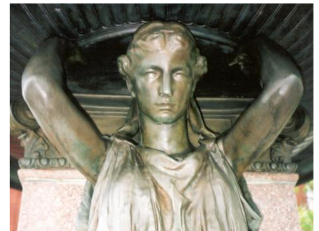
Detail of caryatid sculpture in Olin Warner's Skidmore Fountain graced with C.E.S. Wood's civic slogan “Good citizens are the riches of a city”