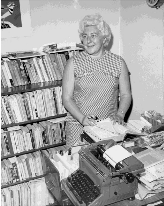
Vi at dictionary

The good writers of the Northwest are careful about merely dropping place names or zeroing in on landmarks—especially when depicting the old or abandoned which are easily made sentimental. We do have levels of meaning in what we write.