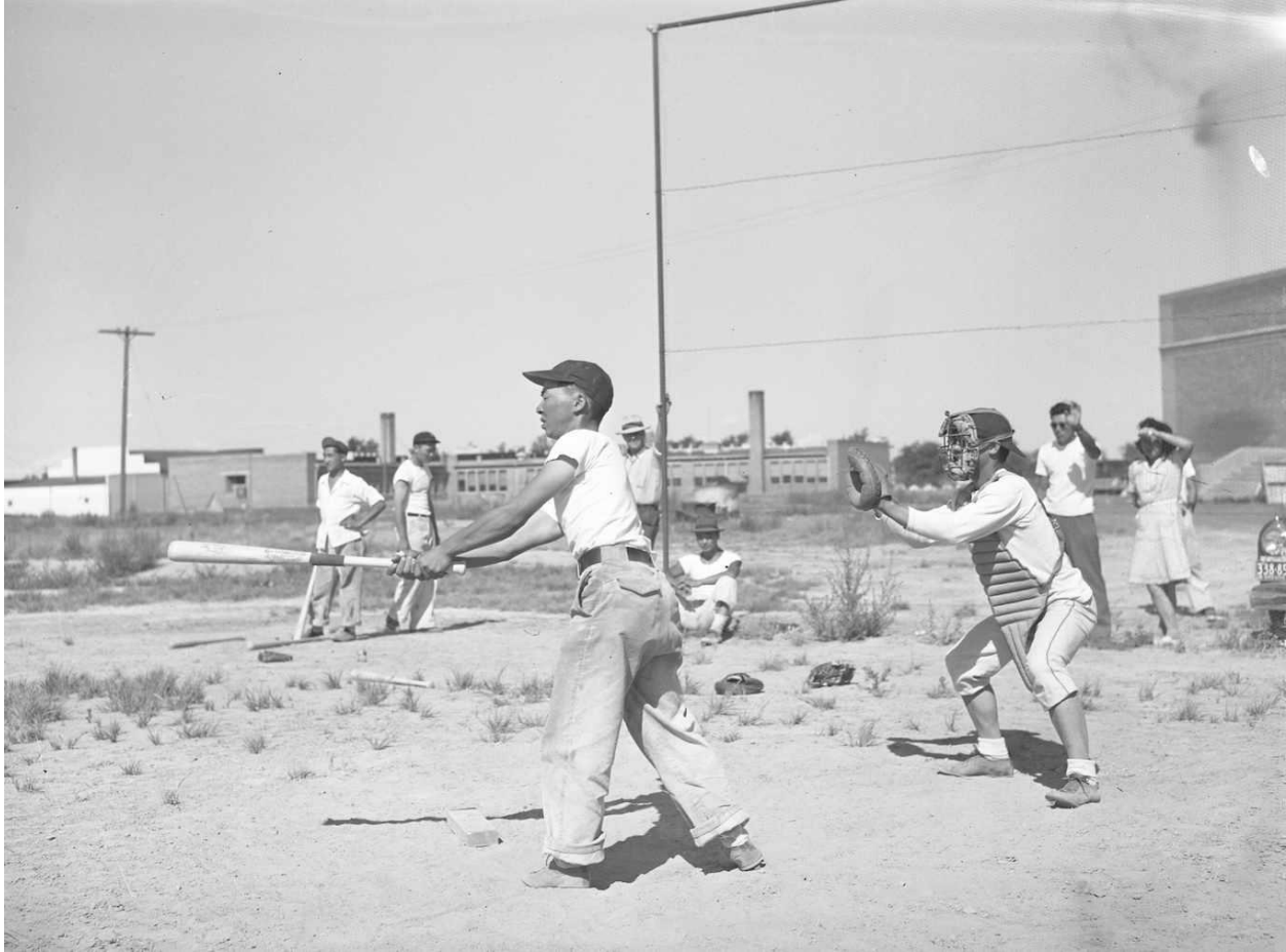
Baseball game at Nyssa High School with laborers from the Garrison's Corner camp.

Nyssa, Oregon. Japanese Americans playing baseball. They do farm work, live at the Farm Security Administration mobile camp, and use the town ballfield on Sundays when they come in a supervised group.