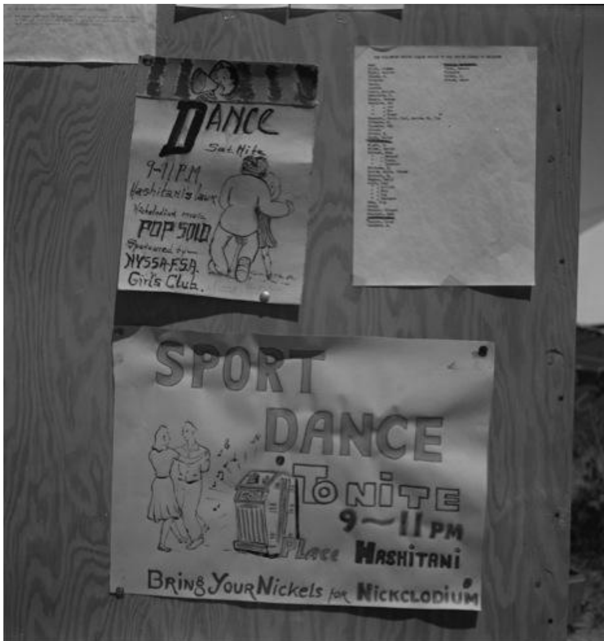
Sign at the Garrison's Corner camp for a dance at the Hashitani family farm near Nyssa, Oregon.

Nyssa, Oregon. Sign for the dance which was given by a local Japanese farmer for the evacuated Japanese American farm workers who live at the Farm Security Administration mobile camp.