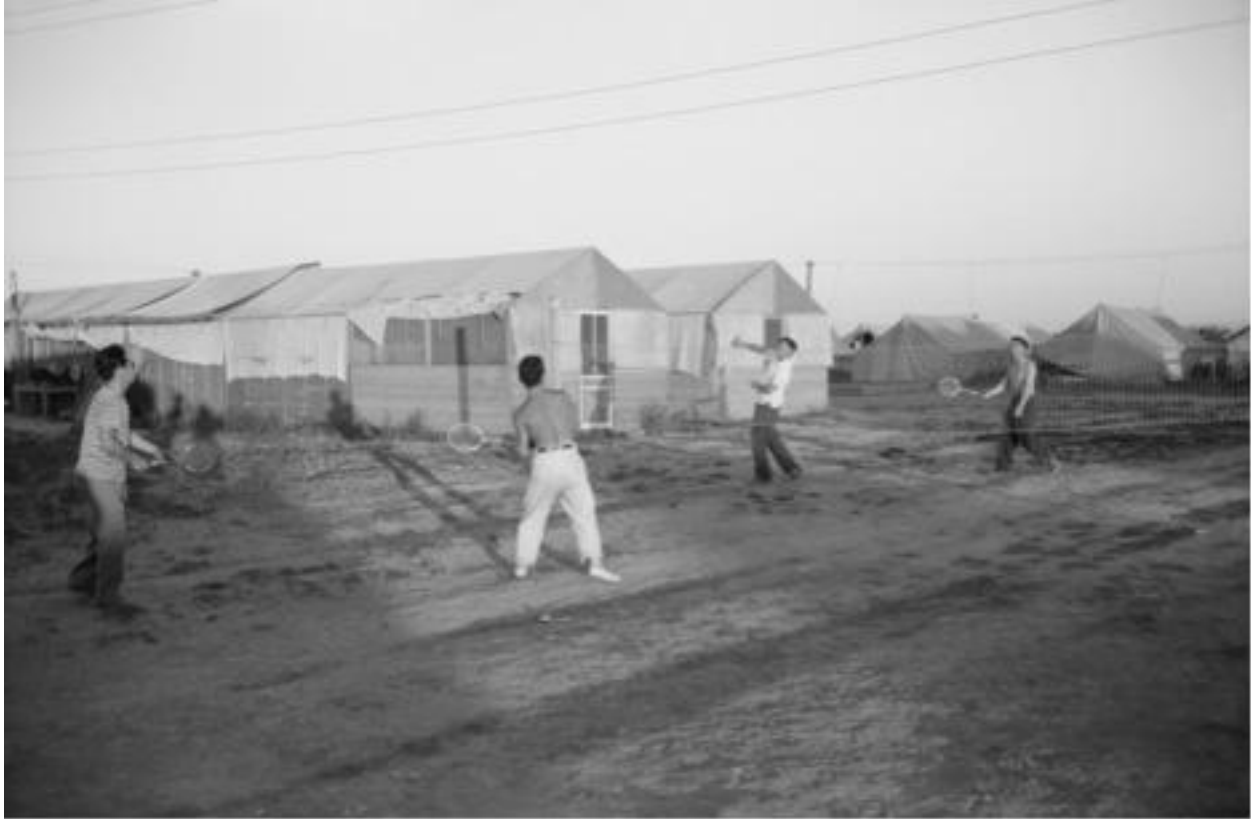
A badminton game at the Garrison's Corner camp near Nyssa, Oregon.

Nyssa, Oregon. Farm Security Administration mobile camp. Japanese Americans play badminton at the camp. Library of Congress, Prints & Photographs Division, FSA-OWI Collection, LC-USF33-013309-M1.