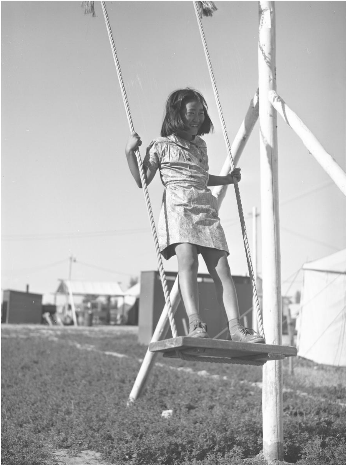
Child swinging at the camp near Shelley, Idaho.

Shelley, Idaho. Farm Security Administration mobile camp. Japanese child who lives with his parents at the camp.