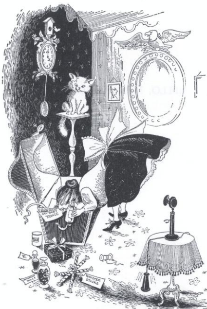
"Cry Baby Tonic," Illustration by Hilary Knight from Hello Mrs. Piggle-Wiggle