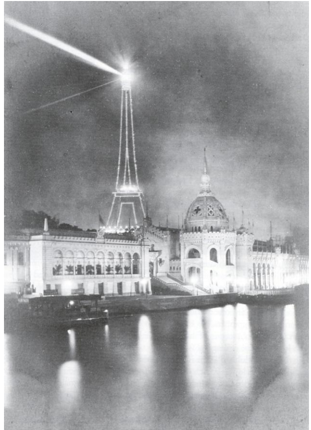
Paris Exposition at Night, 1900 gelatin silver print, 5" x 6¾" Portland Art Museum

"A Wandering Lens – Myra Albert Wiggins: Photographer, Artist and Mentor," Artifact Magazine , 1, March/April, 1996